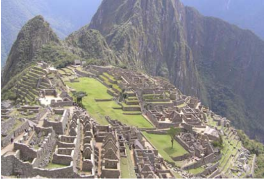
Fabled Machu Picchu

Four-night adventure to South America's spectacular archaeological site – Post-cruise itinerary for Voyage 9229