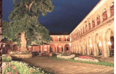
Courtyard at Hotel Monasterio