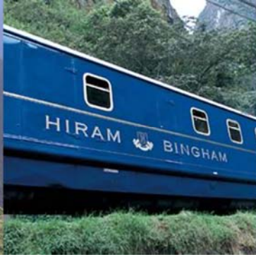
Hiram Bingham Train to Machu Picchu